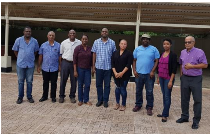
Figure 14. Attendees at the launch of the Central Chapter

The JIE student movement also took part in the 2018 Beach clean-up activities.