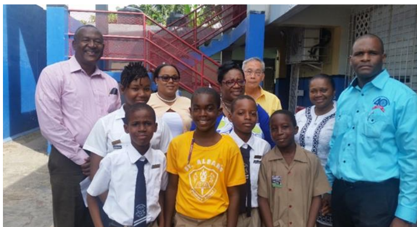
Figure 17. JSIF-JIE visit to St. Alban's Primary School

To support the celebration of National Science and Technology month in November 2017, the Jamaica Social Investment Fund (JSIF) under the aegis of the Integrated Community Development Project (ICDP), implemented a school STEM initiative in collaboration with the JIE.