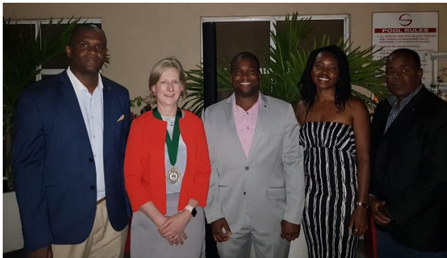
Figure 5. JIE/ISTRUCTE Cocktail Reception