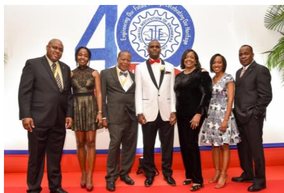
Figure 1. Few members of the Annual 2017 Dinner Planning Committee

This year, the JIE celebrated its 40 th year under the theme “Engineering Our Future Through Celebrating Our Heritage” . Over the years, we have significantly contributed to the development of our members, at the