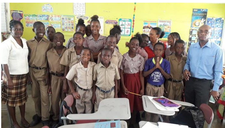
Figure 18. Boy's Town All Age

Forces, Energy and Matter. Soft copies of Past Papers for the period 1998 to 2016 along with videos and Examiners' Study Guides were presented and made available to all the participating schools.