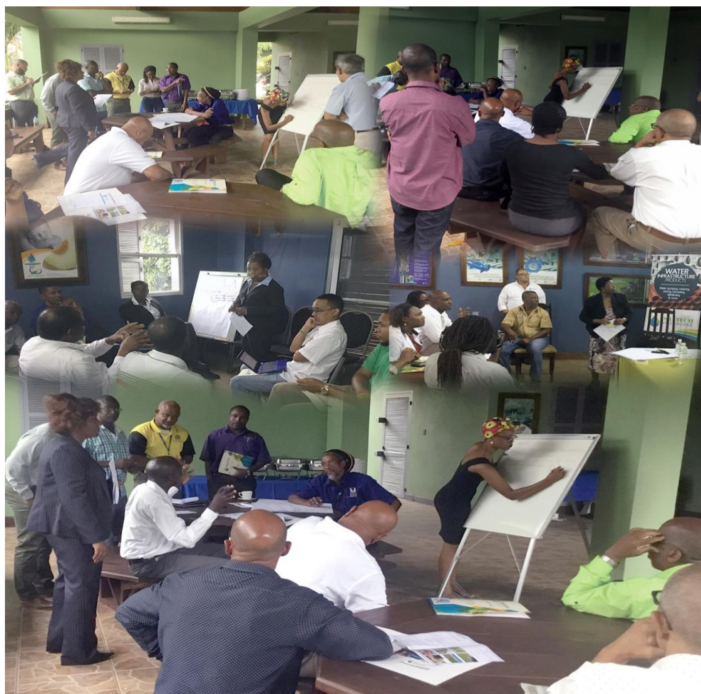
Figure 10. Pictures from the ISRATECH/MICAFA/JIE Symposium

The Symposium's Opening Ceremony consisted of greetings from both the Honourable JC Hutchinson, Minister without Portfolio, who emphasized the need for research and development within the sector and how critical the analysis of seeds, crops and soils are to enhancing the quality of agricultural produce. The Honourable Audley Shaw, Minister of MICAFA spoke to the significance of agriculture as a key pillar of sustainable growth for the nation. He continued to address the importance agriculture plays in the successes of the Vision 2030 development plan. Minister Shaw remarked that the decision is to build resilience in the sector through