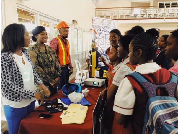
Figure 15. JIE members volunteering at the St. Andrew High School for Girls Career Day