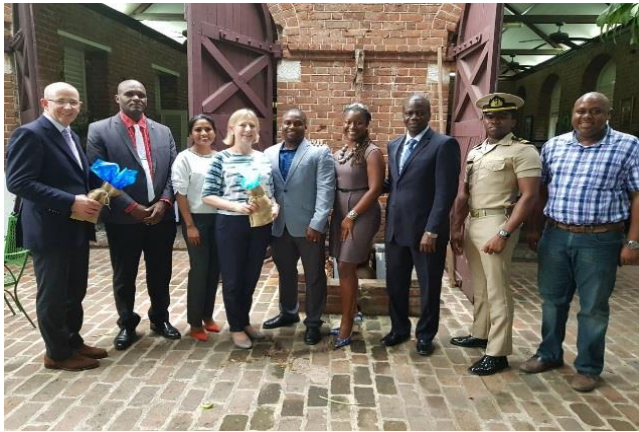
Figure 4. JIE/PERB/ISTRUCTE Luncheon