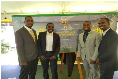
Figure 6. Launch of GOJ House of parliament Design Competition