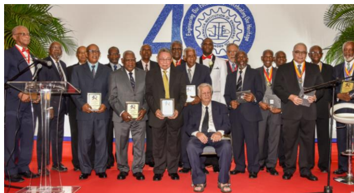
Figure 2. Founding members at the JIE Annual Dinner 2017

In reference to a famous quote from Marcus Garvey “A people without the knowledge of their past history, origin and culture is like a tree without roots” . It is within this context, that we saw it quite fitting for the JIE to appreciate our heritage by honouring our esteemed founding members at our Annual Awards Dinner & Gala held on November 25, 2017. The event which was attended by over 450 patrons, gave us an excellent opportunity to renew and strengthen our ties with the JIE “fore-parents”. The event was well attended with