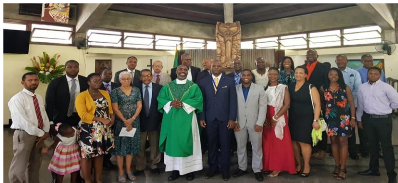
Figure 13. JIE members at the JIE Engineers' Week Church Service

The week of Engineers' Week 2018 activities commenced with a Church Service on Sunday September 16, 2018 at the St. Jude's, Anglican Church, Stony Hill, St. Andrew. The President blessed the new President Medal